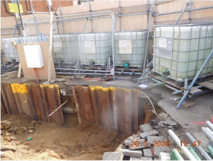
Further photograph showing sheet piles and back filling commenced.