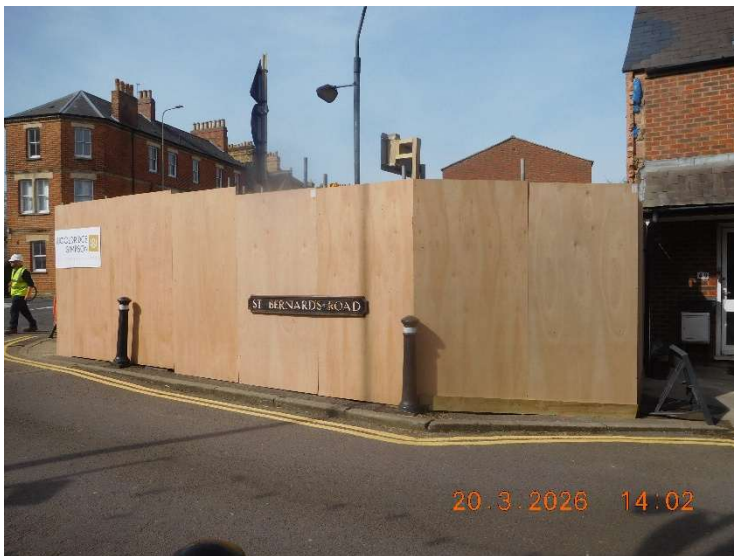
Perimeter Hoarding being replaced on St Bernards Road due to be painted.