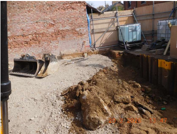
Progress of filling to original basement.