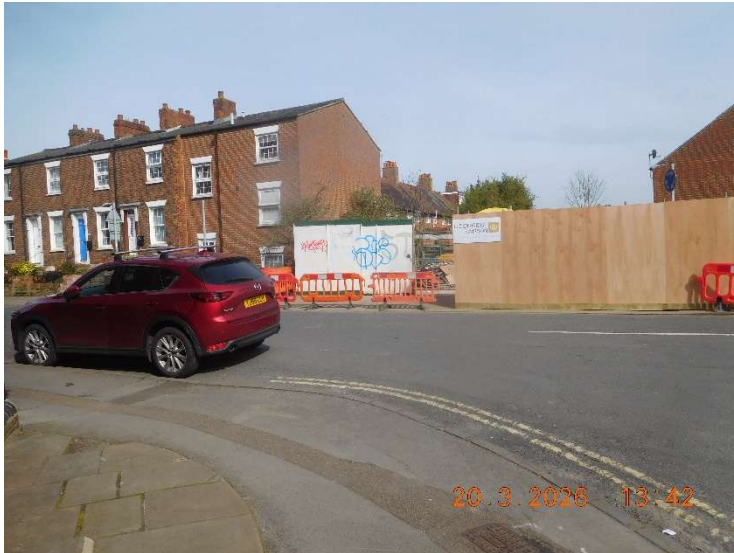
Perimeter Hoarding being replaced on Kingston Road.

Please see below a brief update on current works