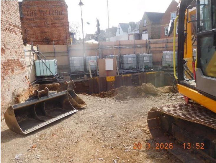
Water Ballast to provide stability to Hoarding.