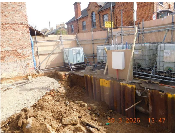
3 metre Sheet Piles in position to retail external services