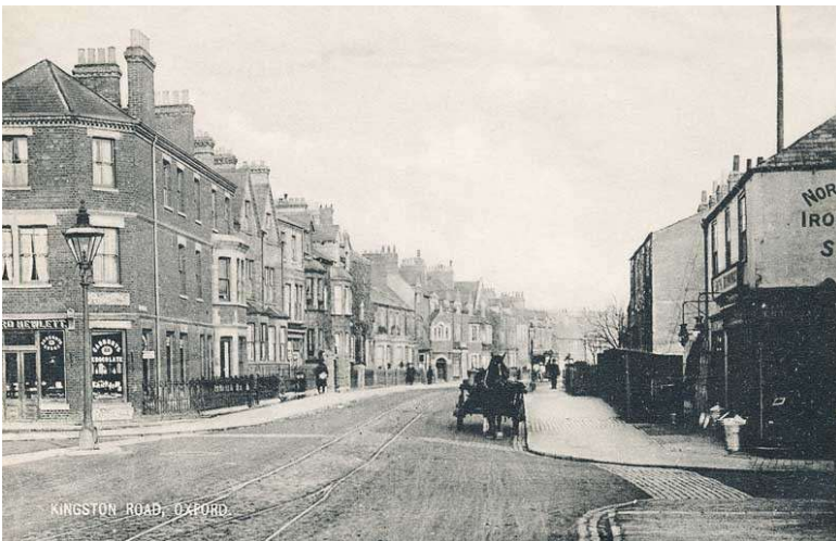
As it was circa 1910.